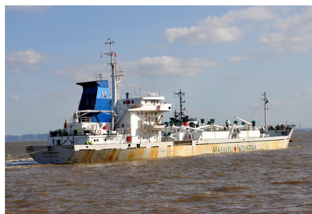
mv Endofrator for Runcorn © Alan Faulkner