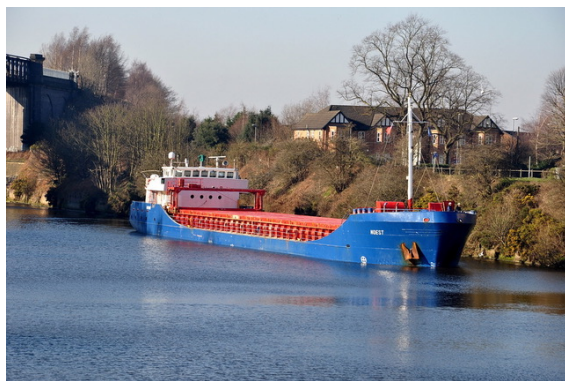
mv Noest arriving Latchford Locks, Manchester Ship Canal

In her report to the AGM she said that she has been involved with major issues surrounding the ICS finances, the presence of the Finance & Remuneration Committee, a new International Chair, a new International Vice Chair, a new Interim Head Office Director, a new Vice President, Bye Law Committee being introduced, the establishment of the Governance Working Group (GWG), undertaking the role of Controlling Council Rep, organising our annual dinner and attending UK Branch dinners, being part of our golf days, study groups, open days, the exams and our regular monthly Committee meetings. - including the one I forgot to turn up to (which I will never live down).