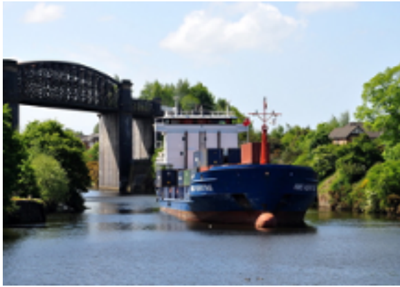
rms Veritas for Irlam, Manchester Ship Canal